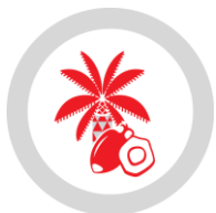
AGRIBUSINESS & FOOD

A consortium of several independently managed, leading Indonesian companies sharing a common history and values. Collectively Sinar Mas businesses provide employment for more than 350,000 people across Indonesia. GAR, known as Sinar Mas Agribusiness and Food in Indonesia, is the world's second largest palm oil company.