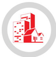
DEVELOPER & REAL ESTATE